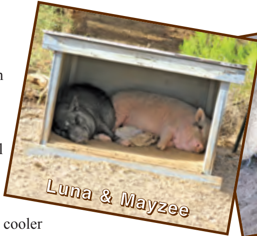
Luna & Mayzee

Cooler weather also means that the pigs will grow their winter coats back. They always look so much cleaner and prettier in the winter! Look at the