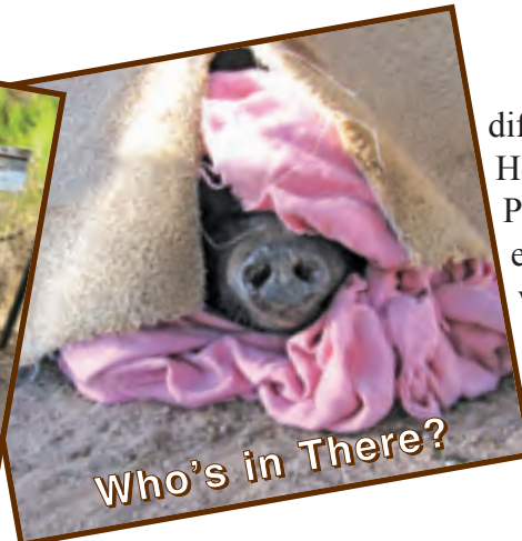
Who's in There?