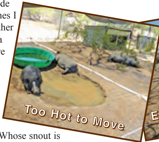
Too Hot to Move