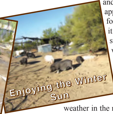
Enjoying the Winter Sun