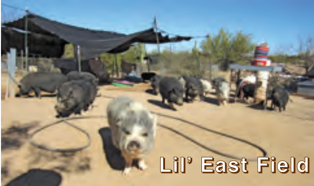
Lil' East Field

The sanctuary has been up and running (and GROWING!) for 21 years! Hundreds and hundreds of pigs have come through our gates over the years. Most have come to live out their lives here, roaming freely in fields with herd mates and friends in a safe, protected environment.