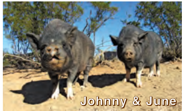
Johnny & June

Some have been adopted to individual forever homes after yard checks and education about pig ownership. Thank you for being a part of all their lives. Here's to all the pigs that have called Ironwood home for the past 21 years!!