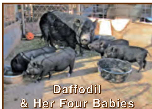
Daffodil & Her Four Babies

Daffodil and her four young babies came from a hoarding situation. All the animals were