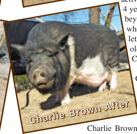
Charlie Brown After

Next, we get to the chubby piggies. Charlie Brown was a much-loved house pig that outgrew his humans' idea of a house pet. They overindulged this boy with treats...all day long! His "Before" picture shows huge,