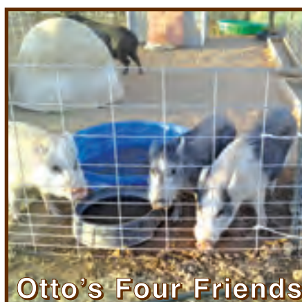
Otto's Four Friends

Otto and his four companions were brought from CA to a nearby foster home after a long wait for space to be available at Ironwood. The owner, now in his 80's with rapidly failing health,