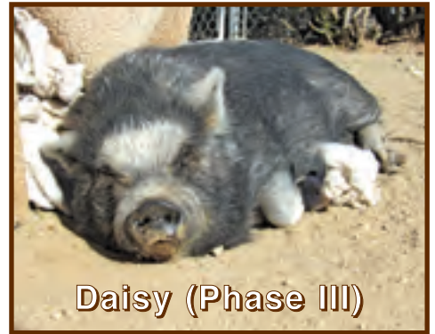
Daisy (Phase III)

with physical disabilities. After her owners moved away in August of 2017, Daisy came to the sanctuary with her friend Dot Dot who has since passed away. Even though she is only 11 years old, Daisy has severe arthritis. Most of her time is spent relaxing and sleeping inside her house, but she is quick to be up and on the move at mealtimes or for the afternoon Happy Hour. She loves her juice and apple slices!