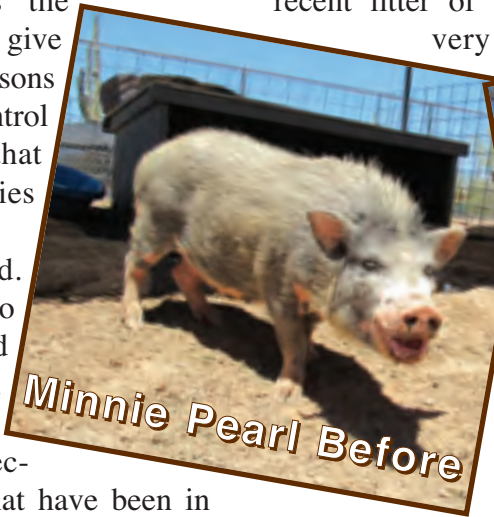
Minnie Pearl Before

“mysteriously disappeared” from the county shelter before we were allowed to pick the group up.) Minnie Pearl had obviously had a recent litter of babies and was very thin.