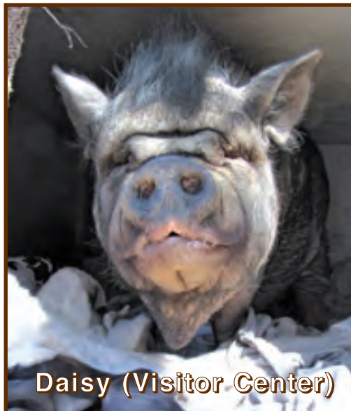
Daisy (Visitor Center)

Another Daisy lives in the backyard of the Visitor Center, one of the special care areas set aside for elderly pigs or those