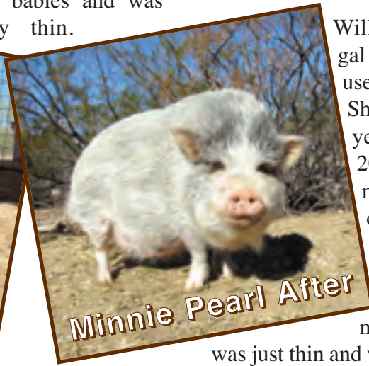
Minnie Pearl After

She was put on extra food rations to allow her to slowly gain weight. Vitamin supplements were added daily for many months until she was looking healthy. Minnie Pearl is around 9-10 years old. She and her best friend that she came here with,