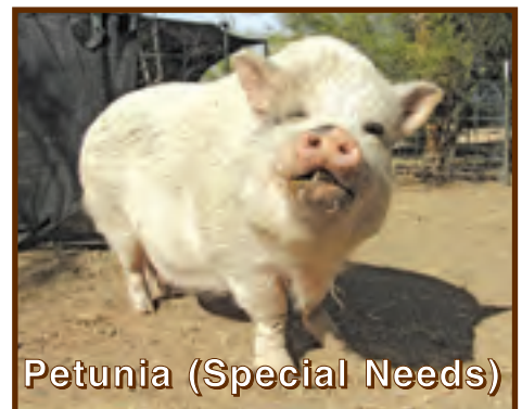
Petunia (Special Needs)

There are two Petunias at the sanctuary. One is a 5-year-old that came in July 2019 after being