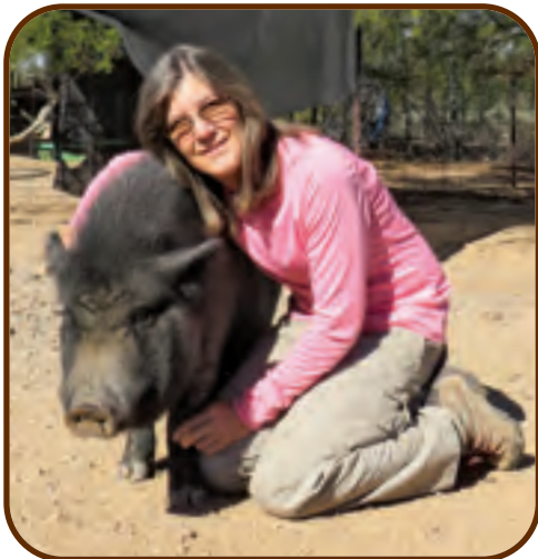
Cole & Donna

Start your New Year with the resolution to become a sponsor! Your $30 monthly donation provides the basic needs for the pig of your choice. You'll receive background information and photos of your pig. Later in the year, there will be an update and new photos. Celebrate the New Year with a pig!