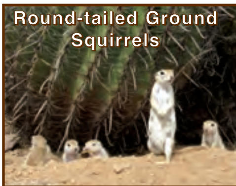
Round-tailed Ground Squirrels

holes, run over to grab a bit of hay then dive back down to eat in peace. Their babies are absolutely adorable!