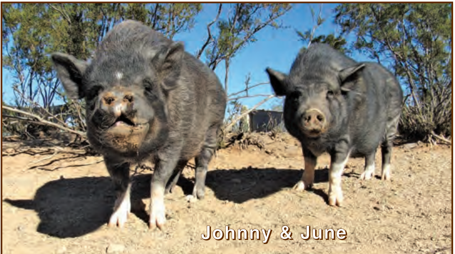
Johnny & June