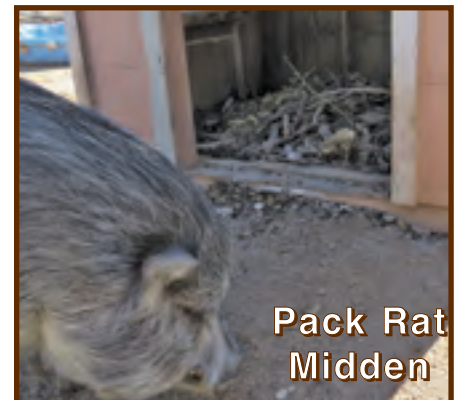
Pack Rat Midden

They collect pieces of cholla cactus as well as pig poop, sticks, blanket fluff and any odds and ends of trash they can find. All of that is piled up in and around the spot they choose as a home. Several pig houses around the property have just been given over to them since they