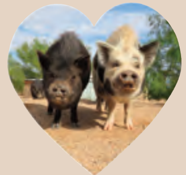
Lando & Chewbacca

Arizona residents who shop at Fry's Food Stores can help the pigs every time you use your Fry's Shoppers card! Just go to FrysFood.com , click on "Savings" then choose "Community Rewards". Follow the prompts to designate the Ironwood Pig Sanctuary as your charity of choice. The number of households signed up did NOT increase during 2022, so get your friends and family involved. It's easy to raise funds at no extra cost to you!