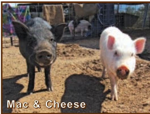
Mac &amp; Cheese

Another 26 pigs arrived during 2018 that had been abused, neglected or simply lived in deplorable conditions. Teddy's home was tiny and completely