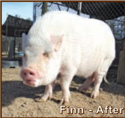
Finn - After

deal of care needing hot packs on his shoulder and manually maneuvering his leg several times a day. Later Finn had to walk for slowly increasing increments of time to build up strength. He is