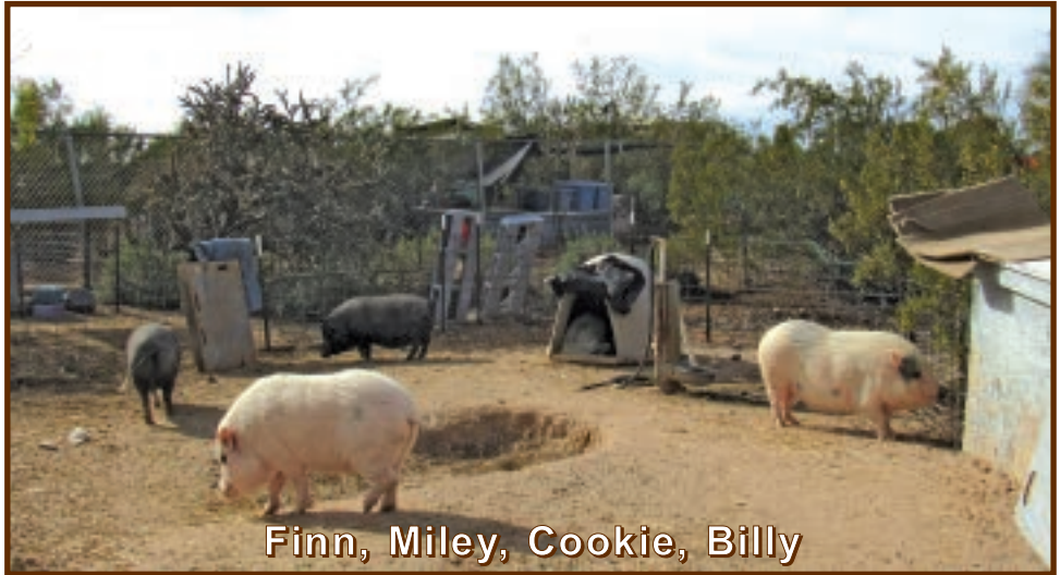
Finn, Miley, Cookie, Billy

All of these pigs, with the exception of Randy, are young pigs with their whole life ahead of them. We felt we would have been remiss since we had the resources to have made any decision other than the ones we made for these young pigs to have the best life they could given the circumstances.