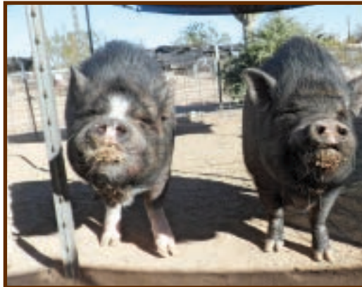
Wyatt & Doc Holliday January 2014

One thing you might notice about me is my crazy hairdo. My mane grows really long in the winter and when I'm happy which is almost always, it stands straight up. When people talk to me or pet me, up goes the hair! And I do