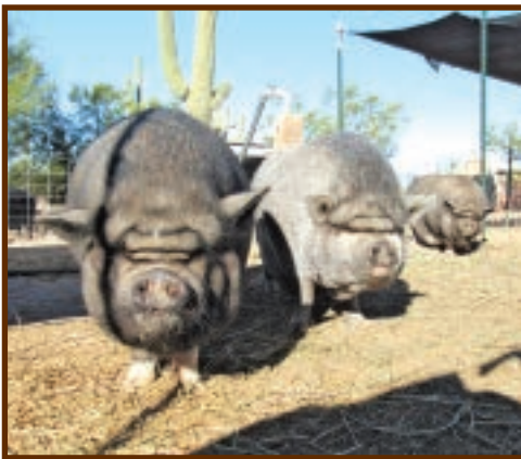
Momma, Smokey, Piggy Pooh

A t the time of this writing, Ironwood's intake of pigs for 2018 had reached 129 pigs. Crazy, right?! And that's only the ones we were able to take. There were many more requests than we could possibly keep up with. Where are