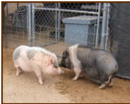
Hero and Wiggly Sizing Up Each Other

social hierarchy in place and when new pigs arrive it shakes things up. New arrivals have to find their place within the herd and old members try to protect their position. How is this done? By fighting with one another! The pigs have to prove how tough they are to see who is going to be dominant and who is going to be submissive. The fighting can be passive...sort of push and shove with a lot of stomping and chomping. At other times the fights can get rather vicious ending up with torn ears, scrapes and scratches.