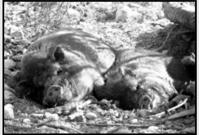
Waylon and Kris

H ere at Ironwood, we greatly encourage potential pig owners to adopt two pigs. Pigs are herd animals and it is best that they have at least one of their own kind for companionship. It has no effect on their relationship with you. But it gives them a buddy to sleep with, argue with, and just be with. It greatly increases the quality of their life. People, dogs and cats are fine, but another pig is a true kindred spirit. As they pal around together and fuss with each other, they get many emotional needs filled that we can't fill for them in any other way. A single pig may become lethargic, bored, depressed and sometimes even aggressive. Having a second pig to hang out with will make for a more active, well-adjusted pig. Pigs are very sensitive and emotional and need a companion who understands their needs, and who better for that than another pig!