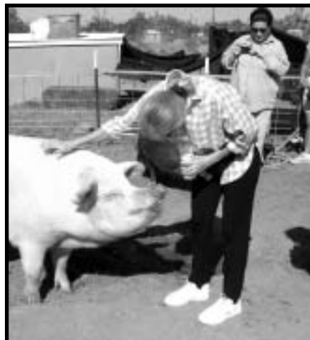
Pinkerton Getting Some Attention

With all the people streaming in it looked like Woodstock!