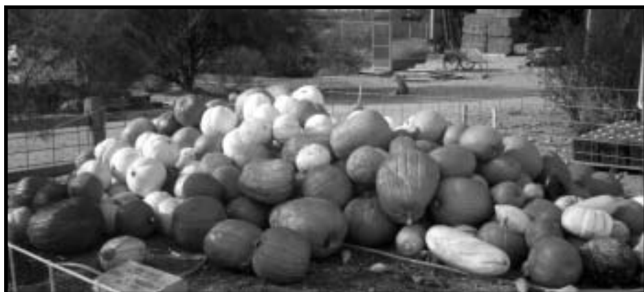
Donated Pumpkins for the Piggies!